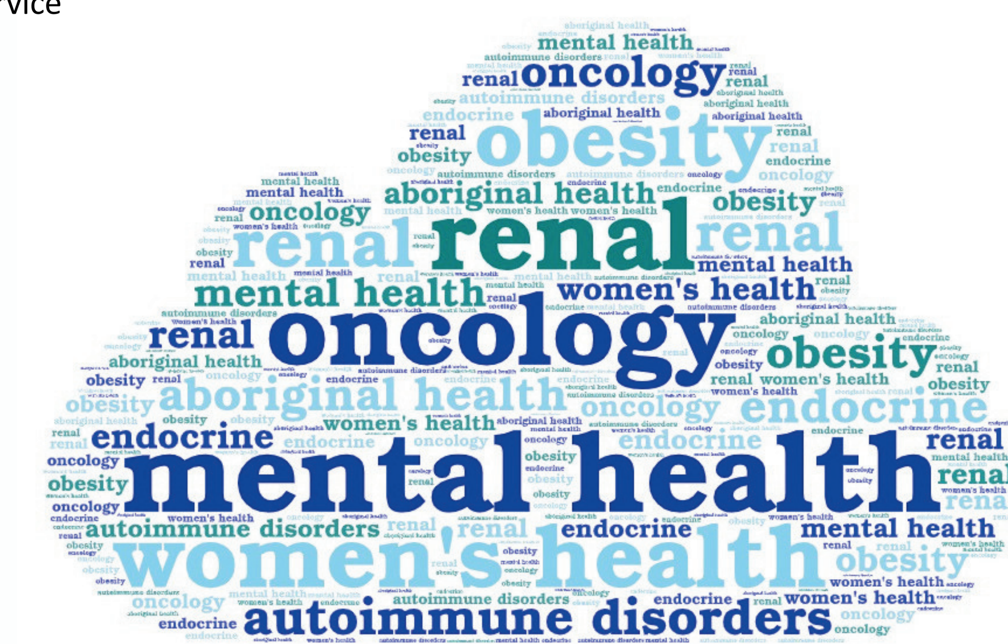
Medical areas of clinical trials

Australian Clinical Trials Education Centre (A-CTEC) Learning Management System open in SA (September 2022)