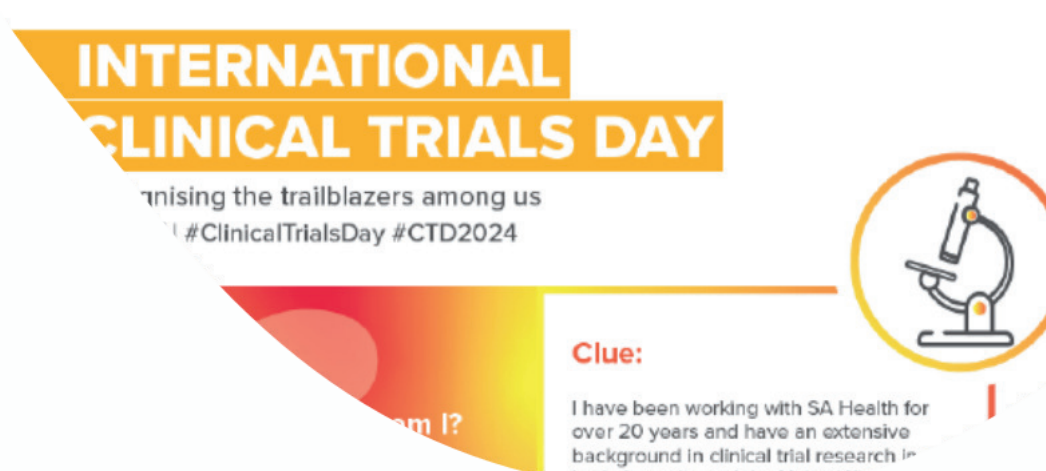
Above: The CitiCentre TV screen provided a bold digite' presence.